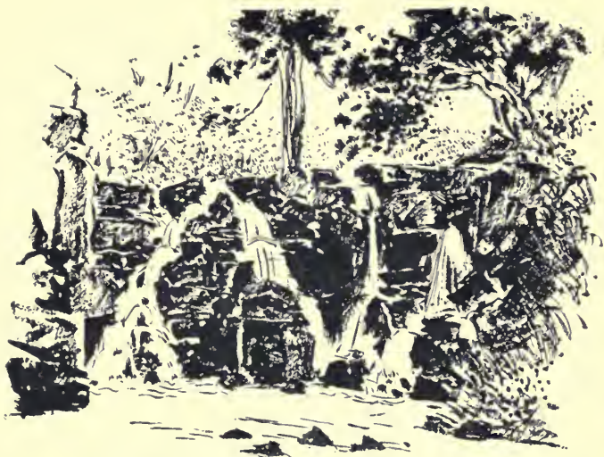
Waterfall Virginia water